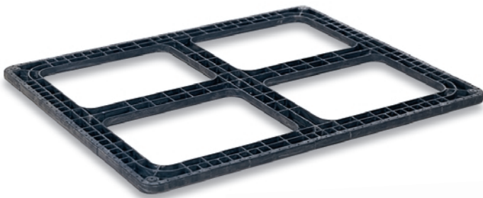
44 x 56 4" Top Frame (Full Center Stringers)

The 4" or 6" wide perimeter frame provides superior support for many types of product loads. The channeled edge design and structural foam injection molded construction offers exceptional strapping strength. These top frames can be used with a temperature range of -20°C to 55°C (-4°F to 130°F). They are available in three versions for versatility: No Center Stringer, Single Center Stringer and Full Center Stringer.