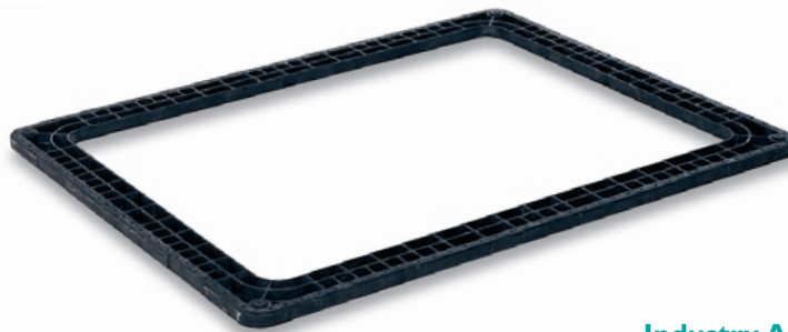
44 x 56 4" Top Frame (No Center Stringer)